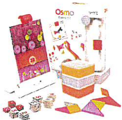
Osmo Genius Coding Kit

All monies from the spellathon will go towards purchasing to enhance our provision from our wish list. Here are a few items we wish to purchase: