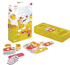
Osmo Coding Extension Kit