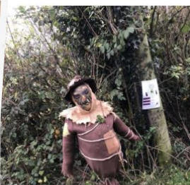
Halloween Walk £155