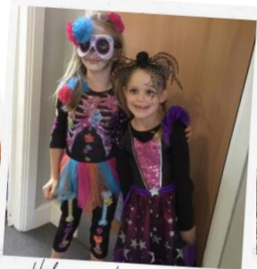
Halloween Iron uniform £341