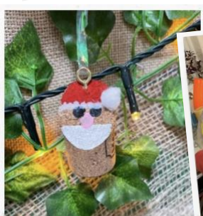
Fair sales £633.50