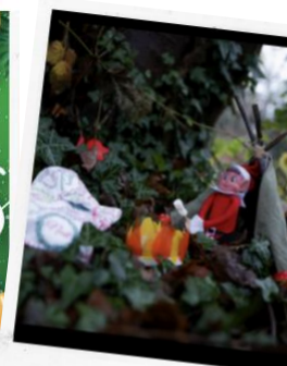
Elf Trail £311.22