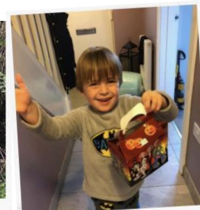
Halloween Treats £302