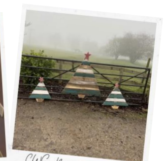
CWS Maintenance Trees £100