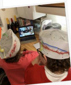
Festive Cooking £121